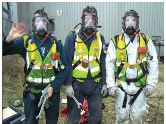
A team of Utile fully trained and certified engineers after completion of another successful inspection