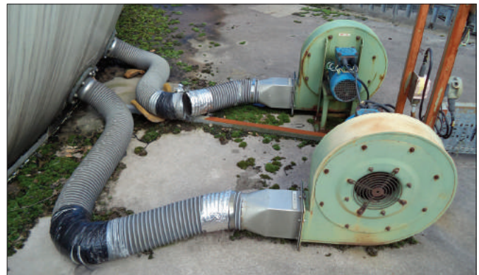
Inspection reveals major safety issues due to lack of regular on site maintenance

With the increasing need for larger stored volumes of gas to aid the strategic use of CHP or for gas to grid applications, we can provide "special shaped" gas holders to increase the stored volume but utilising the existing plinth and ancillary equipment. This can save considerable cost when comparing against full replacement services.