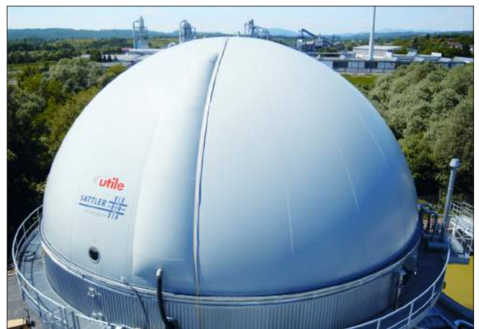
Digester roof "dome" with double membranes for gas storage

Utile are in the privileged position to be able to provide their team of fully trained, certified and skilled engineers to carry out these services on your Gas Holder, whoever the original manufacturer. We are perfectly placed in the Midlands to conduct these services throughout the UK for Water Companies, Municipal Contractors, Waste to Energy and Farm AD Plant. We are ISO9001 and Gas Safe Certified and have Achilles UVDB B2 Audit Status, ensuring we conduct our works with the utmost safety in mind, providing a full Inspection schedule and report to allow you to make strategic decisions about your plant.