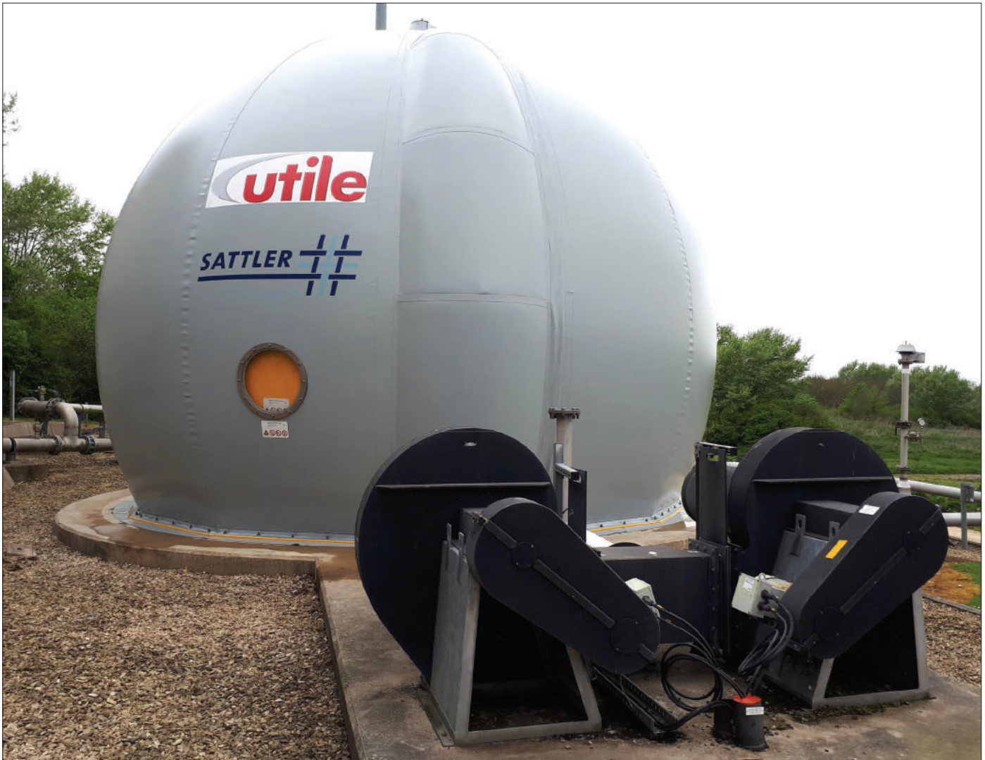
Utile will supply new Sattler membranes with existing air blowers, OPV & controls to maintain plant safety and integrity with minimal spend.

We provide a pro-active approach when working with our customers to identify potential failures and detect deterioration before an issue can become catastrophic.